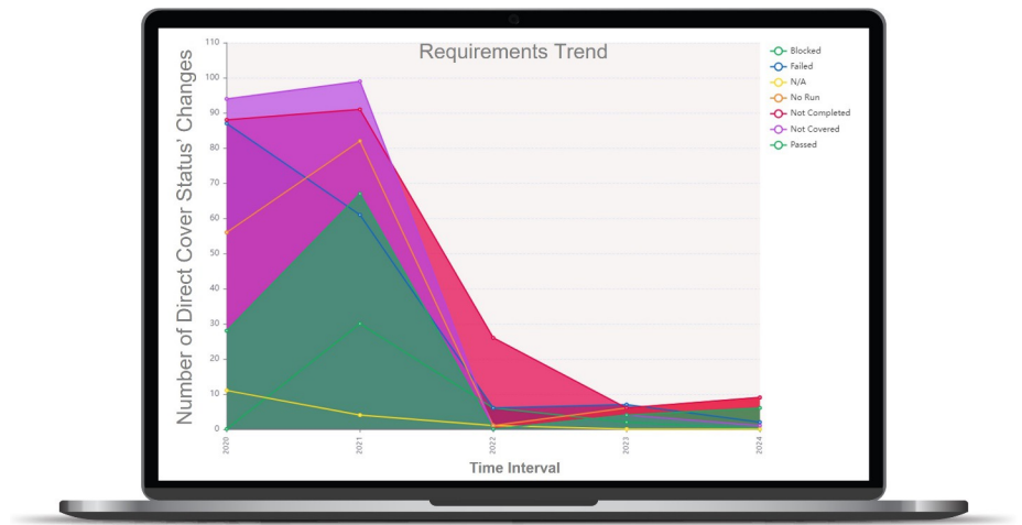
Example of ALM/Quality Center reporting