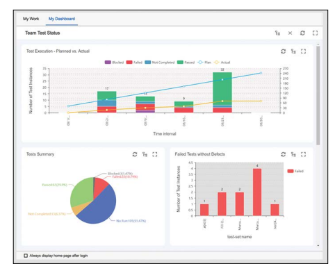
Figure 1. Personal dashboard in My Homepage

The personalized My Homepage serves as the landing page to boost user productivity. It shows the user's open work items and most recent updates, as well as his personal dashboard.