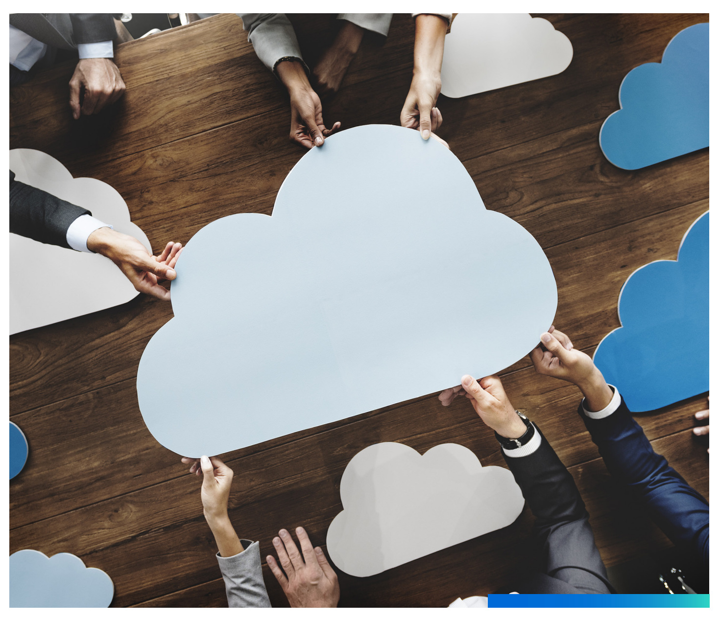
Brochure Application Delivery Management